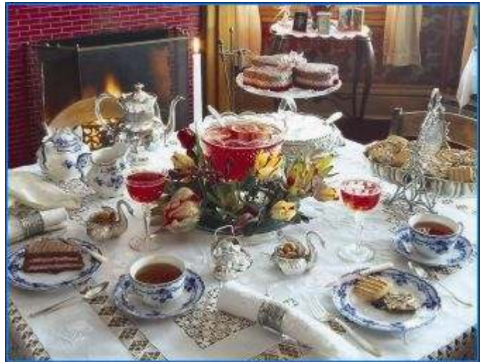
A fully set and decorated tea table