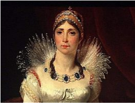
Left: The Empress Josephine in a very fancy evening gown with accessories

Now that we know what a lady needed to wear to a ball, let us move on to watching her at her “toilette.” The following is an excerpt from my Regency Inspirational Romance, Before the Season Ends . Ariana Forsythe is getting ready for an evening party at which there will be dancing.