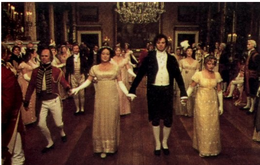
The Netherfield Ball ( Pride and Prejudice 1995 BBC)

Excerpt taken from, Before the Season Ends , a Regency Inspirational Romance.