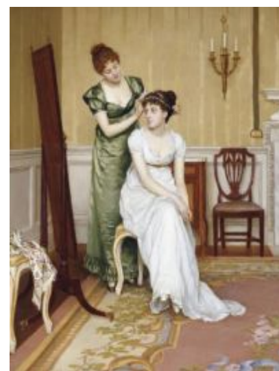
"Preparing for the Ball"